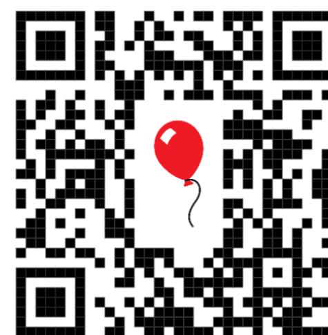
Standard Hospital Information